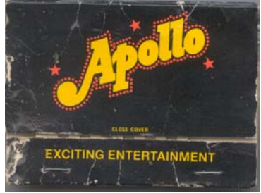
Yes they even made "Apollo" matches!